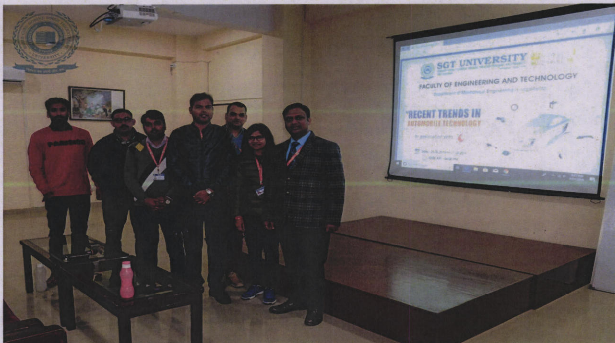
Organizing team with the Programme

Registrar SGT University, Budhera, Gurugram