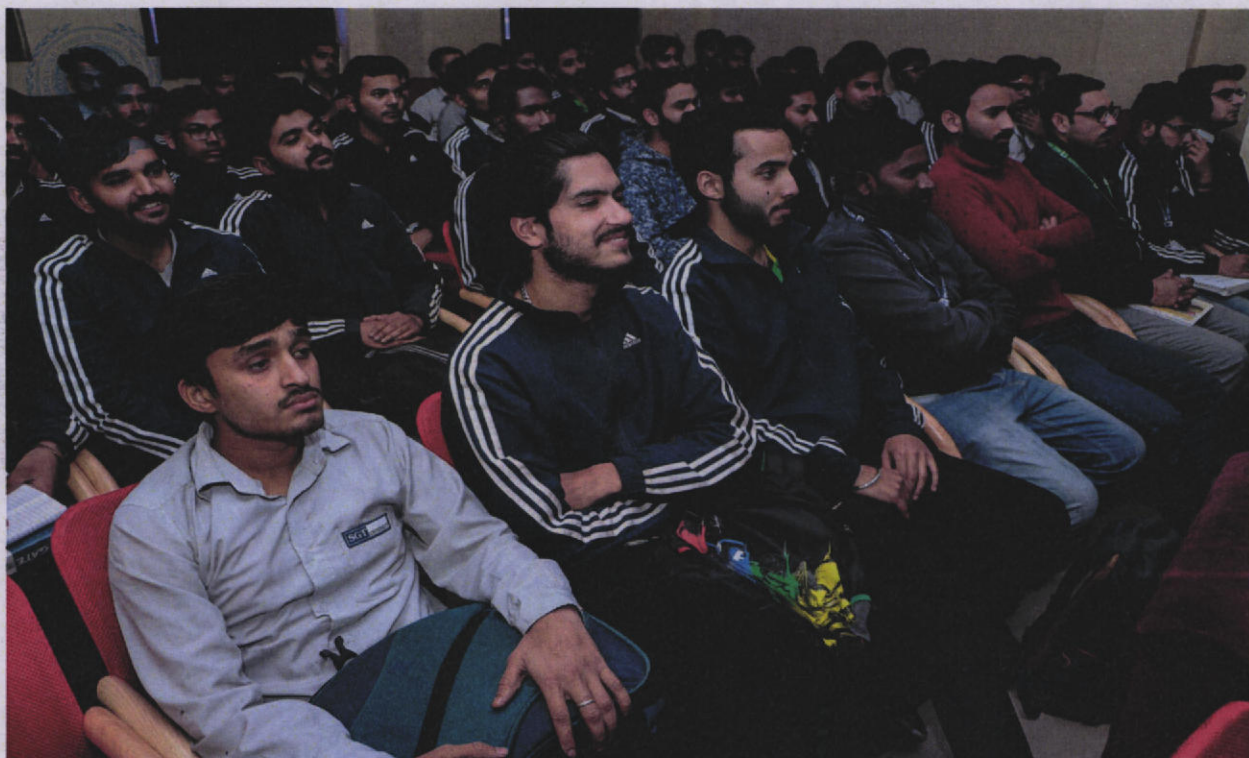
Participants of the workshop

Budhera, Gurugram-Badli Road, Gurugram (Haryana) – 122505 Ph. : 0124-2278183, 2278184, 2278185